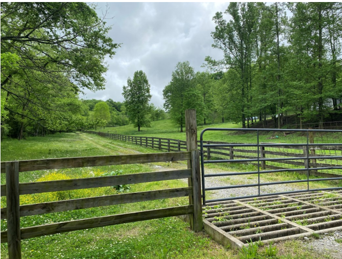
Cattle Gate Easement

Barn. The barn was damaged in a storm and is being brought back to original build standards.